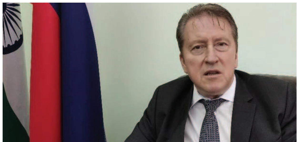
Nikolay Kudashev, the Russian envoy to India, lauded India's 'comprehensive efforts' that resulted in significant "decrease in the rate of infection".

New Delhi: (U.N.S) Russia has called India's decision to send hydroxychloroquine medicines, to combat the coronavirus COVID-19 crisis, as "nobel", adding that the gesture will be reciprocated. Nikolay Kudashev, the Russian envoy to India, lauded India's 'comprehensive efforts' that resulted in significant "decrease in the rate of infection".