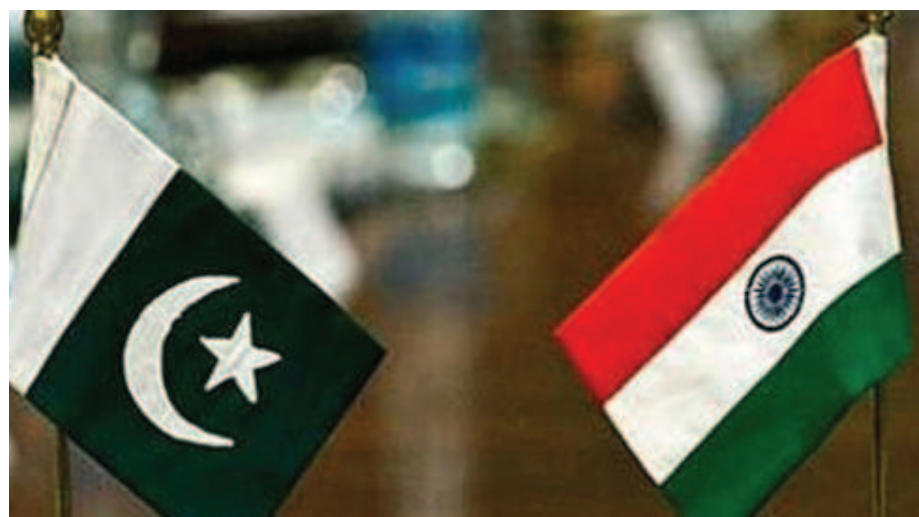
Pakistan on Thursday hosted a meet on COVID-19 pandemic in which the country had invited all the SAARC countries.

New Delhi: (U.N.S) Recalling its move on SAARC for a regional joining the initiative. "Prime Minister Narendra Modi had bution being 10 million dollars. Pakistan was initially hesitant with the